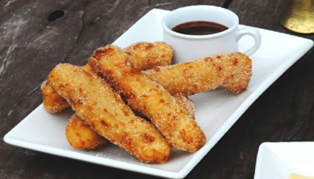
Churros with Tableya